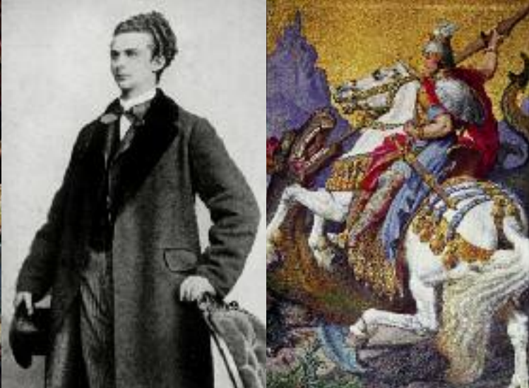
Photo of King Ludwig II (left); Mural of »St. George killing the dragon« from the Throne Hall (right); Majolica swan (below)