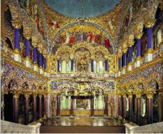
The walls of the Throne Hall glorify canonized kings and their deeds.