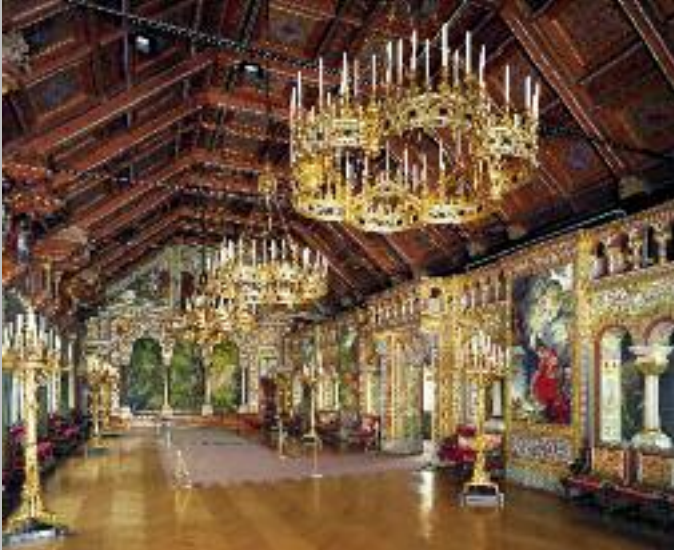
The Singers' Hall on the fourth floor of the castle