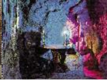
Palace kitchen (top left); Grotto with coloured lighting (bottom left); Study (right); Jewellery casket (below)