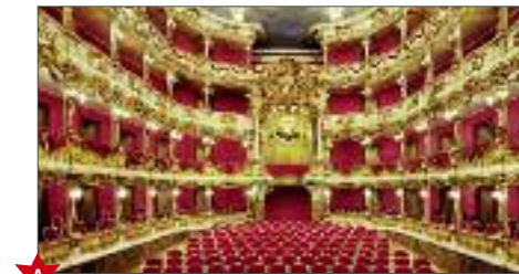
A Cuvilliés Theatre