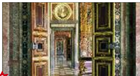
★ Steinzimmer (Stone Rooms)