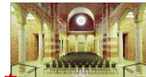
D Court Church of All Saints