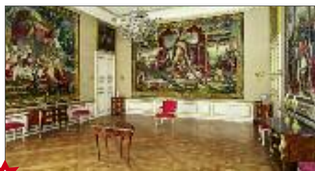
★ Electoral Apartments