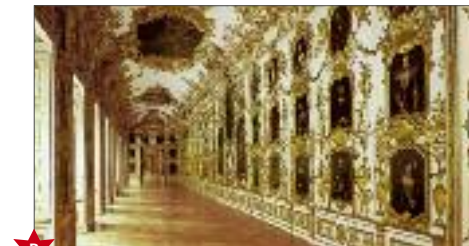
B Ancestral Gallery