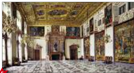
★ Imperial Hall