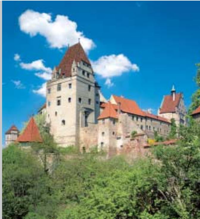
Trausnitz Castle from the southwest, in the foreground the Wittelsbach Tower