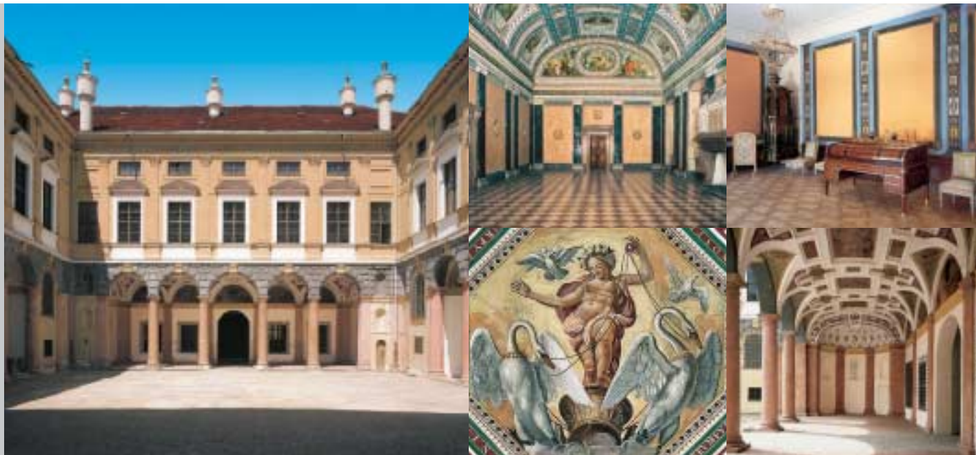
Inner courtyard of the Town Residence facing west