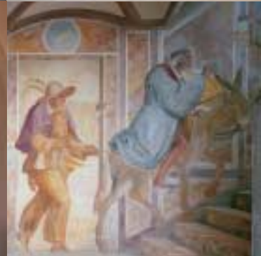
Wood-paneled Söllerstube (top left); Inner castle courtyard (top right); Old knights' Hall (bottom left); Fools' Staircase (bottom right and title)