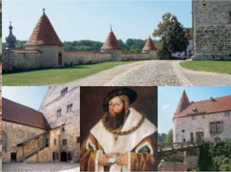
Second outer courtyard (top); inner courtyard (bottom left); "Duke Georg the Rich" (below middle), Georg's Gate (bottom right).