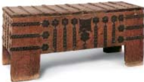
Late mediaeval chest

The accommodation for the ducal court towers over the inner courtyard at the south end of castle hill. The earliest parts here date back to the days of Duke Heinrich XIII. Much extension work was done under the Rich Dukes of Bavaria-Landshut, particularly after 1475 under Duke Georg the Rich. His consort, Hedwig, daughter of the Polish king and the bride in the famous Landshut Wedding, resided here. At the outermost point is the "Palas", or Great Hall, containing the Duke's private accommodation. On the side of the courtyard facing the Wöhr is the section which once housed the apartments of the Duchess and her court. Today this is occupied by the municipal museum of Burghausen. On the town side is the "Dürnitz" building, or Knights' Hall, with its two impressive vaulted halls, formerly the wine cellar and the dining room for the ducal court. The hall on the ground floor is now a visitors' centre, with a display of archaeological excavations. The gatehouse, fortified wall and keep form the bulwark to the first outer courtyard. From on top of the fortifications there is an impressive view around the main part of the castle. Access to the outer fortifications at Eggenberg is also via these walls.