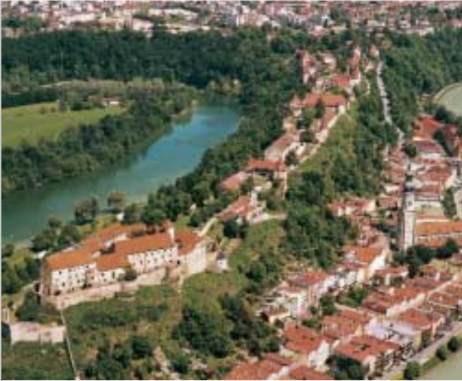
The castle complex between Wöhrsee (left) and the Salzach (right)