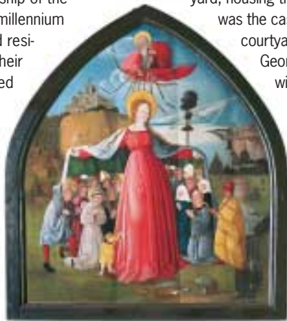
Madonna of Mercy, a painting from the outer court chapel

In 1180 the castle passed into the ownership of the Dukes of Wittelsbach. For a quarter of a millennium – from 1255 to 1503 – it was the second residence of these dukes of Lower Bavaria, their main residence being in Landshut. It served as a court for the Dukes' consorts, a home for ducal widows, a grand gaol and as a stronghold for gold and silver treasures. In 1255, under Duke Heinrich XIII, work commenced on the buildings in the main part of the castle. During the 14th century the fortifications were extended right around castle hill. From 1475 onwards Duke Georg the Rich set about turning the castle into the strongest fortress in the region.