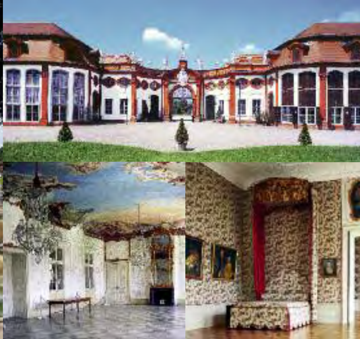
The orangery with the Memmelsdorf Gate (top); The White Hall (bottom left); The Bedroom of the First Envoy (bottom right)