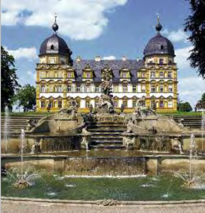
View of Seehof Palace from the cascade