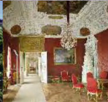
View from the cathedral square of the New Residence (top); one of the highlights is the Imperial Hall (below and title photo)