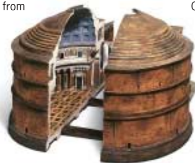
Pantheon, collection of cork architectural models

Johannsburg Palace, until 1803 the second residence of the Mainz electoral archbishops, is located in the centre of Mainz by the River Main. The massive four-winged complex, built from 1605 to 1614 by the Strasbourg architect Georg Ridinger in place of the medieval castle but incorporating the 14th century keep, is one of the most important examples of German palace architecture from the Renaissance era. At the end of the 18th century, the interior was redesigned in the neoclassical style by Emanuel Joseph von Herigoyen. After severe damage in the Second World War the palace was restored, beginning with the exterior. In 1964 the Bavarian Palace Department was able to reopen its state rooms and collections: the palace church with