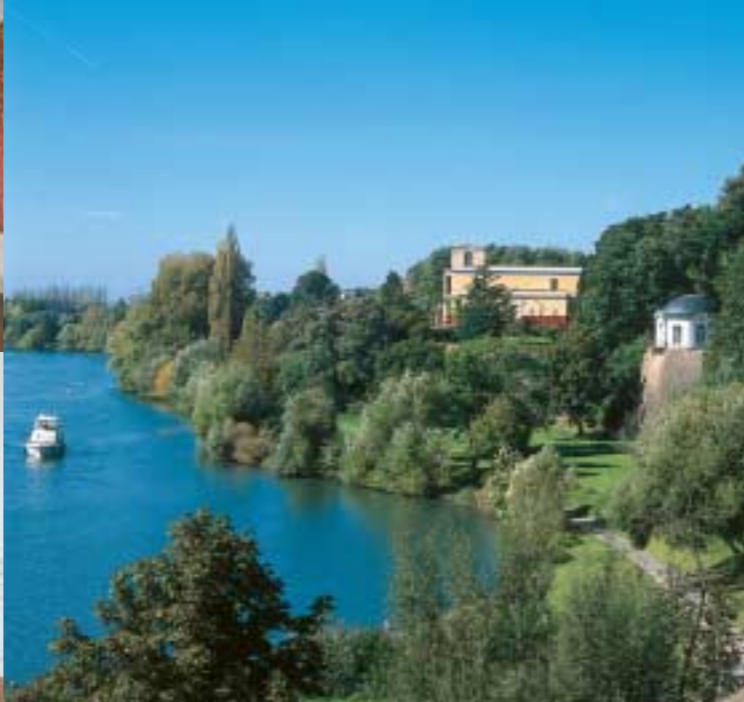
View from Johannsburg of the park on the banks of the River Main with the Breakfast Pavilion and Pompeiianum