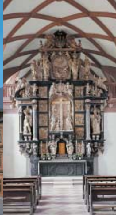
Altar of the palace church (left); Bedroom and Salon in the Princely Apartments (right)