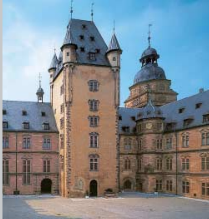
The medieval keep was integrated into the new Johannsburg Palace