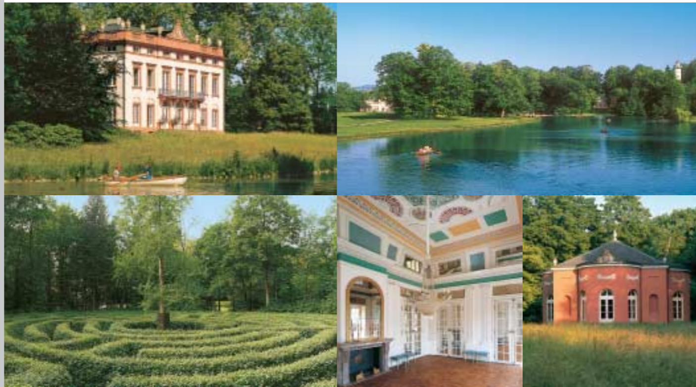
Schönbusch Palace (top left); View of the Lower Lake from the Red Bridge (top right); The maze (bottom left); The hall in the palace (bottom centre); The dining hall in the park (bottom right).

In the kitchen building of the park is a visitor centre, open at weekends and on public holidays from April to September. It contains an exhibition on the fascinating history of this important landscape garden. Next to this building is a small garden with attractively planted flowerbeds.